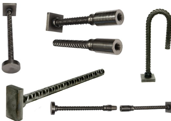
Figure 1 Examples of HRC products: HRC100 Series T-headed bars, HRC400 Series rebar couplers, and HRC720 threaded sleeves

The rebar is cut to length according to the production order. Small, unusable cut-off lengths are collected and sent to recycling. The raw material for end-components is cut to correct length/geometry. Threaded components (rebar couplers and cast-in connections) are processed by CNC-machines. Small, unusable cut-off lengths and swarf from cutting and CNC-machining are collected and sent to recycling. The end components are attached to the rebar by friction welding. The process uses no additional material or consumables. If required by the production order, products are bent by a rebar bending machine.