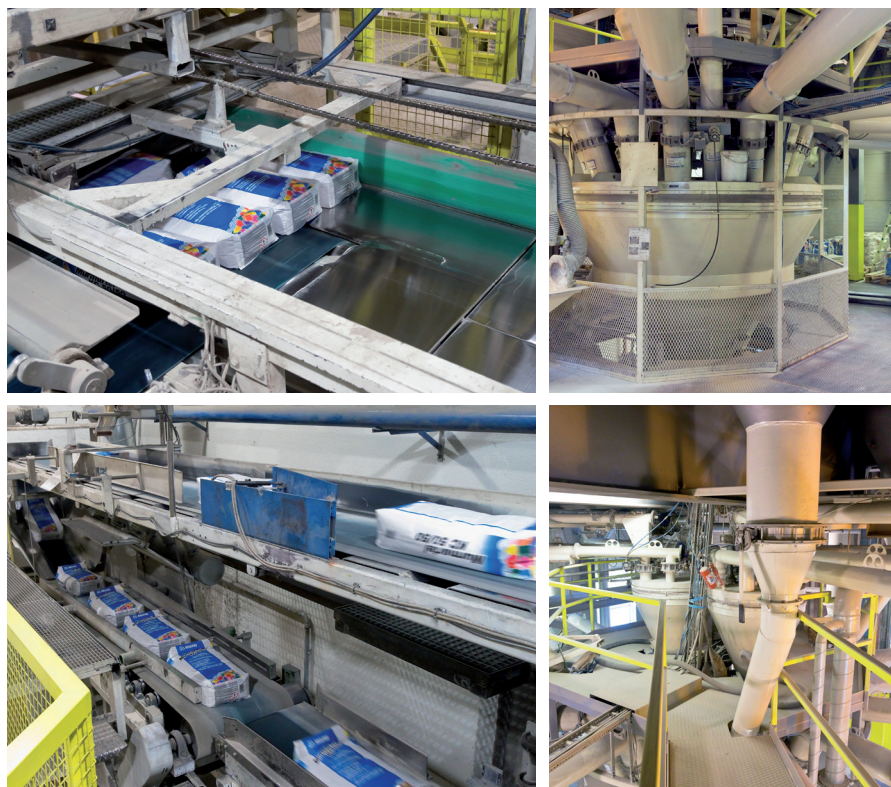
Figure 1: production process