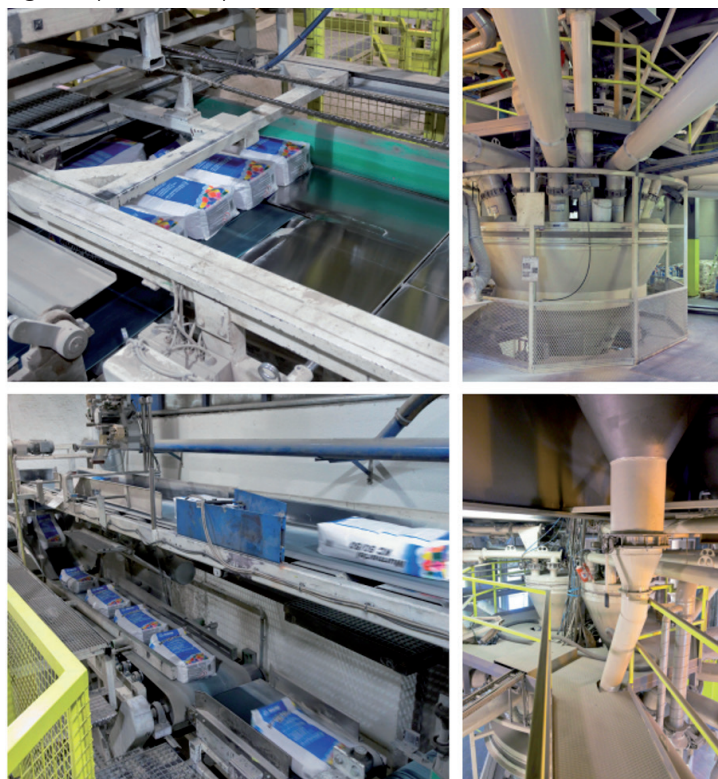
Figure 1: production process detail